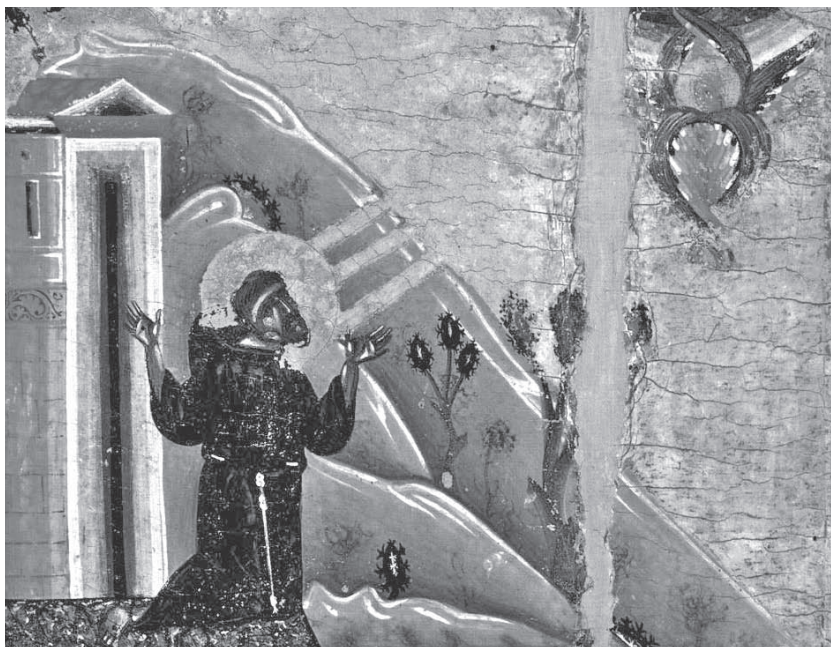
Stigmata (from Bardi Dossal 1245)

The recreation of the first Christmas scene at Greccio, the intense love for the Eucharist, and the mystical events of a lonely retreat on LaVerna and the reception of the stigmata bear eloquent witness to Francis' tremendous devotion to Christ.